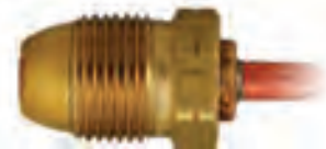
Male Hard Nose POL, 7/8" Nut