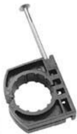
PVC "ALL-AROUND" NAILER

- Plastic half clamp preloaded with nail. For copper, PEX, CPVC and polybutylene tubing.