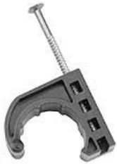
PVC TUBE NAILER