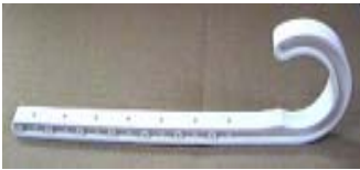
WHITE ABS J-HOOKS