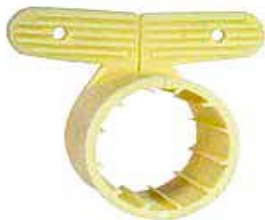
PVC SUSPENSION CLAMP

- Isolates tubing from wood to prevent vibration noise