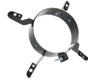
Four Leg Torsion Flex Mount Bracket