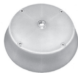
Rainshields - Plastic Deep Dish Style