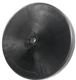
Condenser Fan Rainshield Deep Dish Style