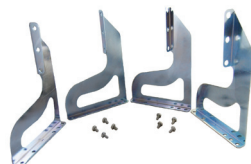
RHEEM FLEX Mounting Bracket