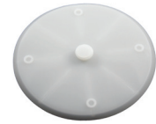
Condenser Fan Rainshield