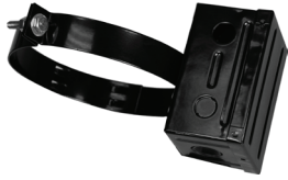
Conduit Box with Adjustable Bracket