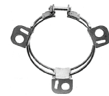
Universal Lug Mounting Bracket