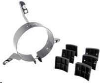
Flex Mount Bracket Adjustable Diameter