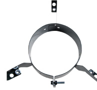
Flex Mount Brackets