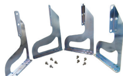
RHEEM FLEX Mounting Bracket