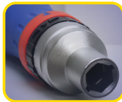
7/16" Nut Driver