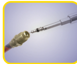
Valve Core Removal Tool