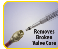
Valve Core Pick Extractor