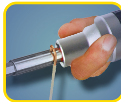
Wire Bender (up to 12 gauge)