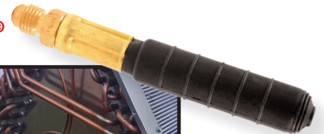
40061 Sludge Blaster ®

3. Replace PVC cap on "T" connection. For future service: DO NOT GLUE PERMANENTLY.