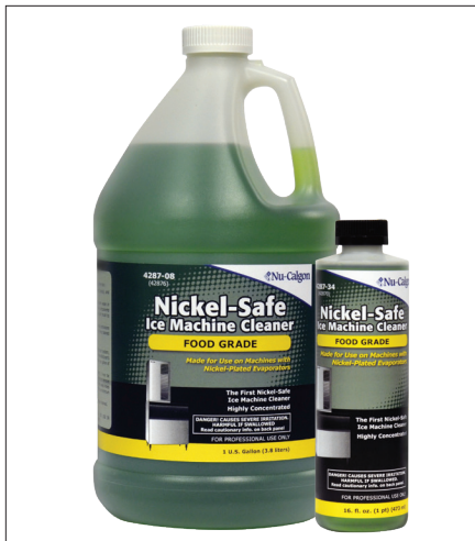
Nickel-Safe Ice Machine Cleaner

Nickel-Safe Ice Machine Cleaner is a specially formulated citric/phosphoric food-grade product for removing scale deposits from ice makers having nickel-plated or tin-plated evaporators. It is acceptable for use in machines made by Manitowoc and other manufacturers using nickel. In fact, it was the industry's first nickel-safe product, introduced in collaboration with Manitowoc. Usage rate should be in accordance with the manufacturers instructions or 16 fluid ounces with three gallons of system water.