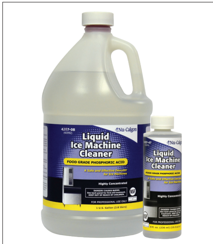
Liquid Ice Machine Cleaner