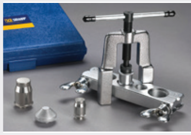
60455 large-size swages and flares for 3/4", 7/8" and 1-1/8" O.D. tubing