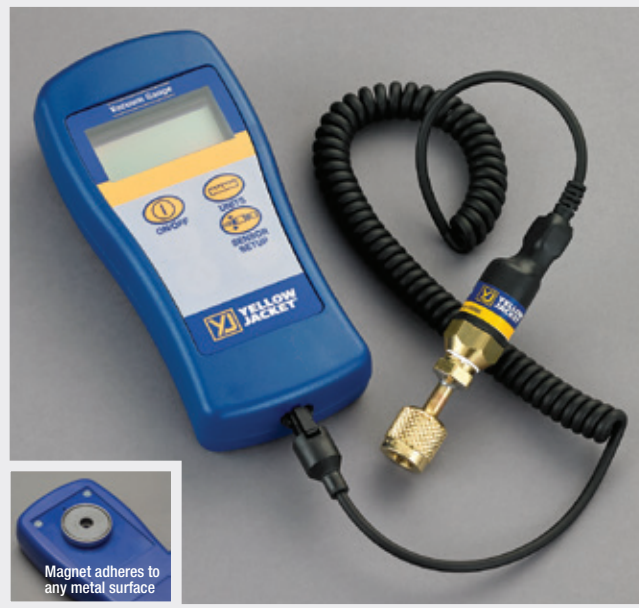
Magnet adheres to any metal surface

This easy-to-use gauge shows that air and moisture have been removed from the system. Simple push of a button changes the display readout between 7 units of measurement. Each displays from atmosphere to 10 microns (bargraph indication above 25000 microns) of vacuum to let you know that your vacuum pump is clean and performing properly. If the sensor gets dirty, simply plug a new sensor into the gauge, run through a quick calibration process and be back on the job within minutes.