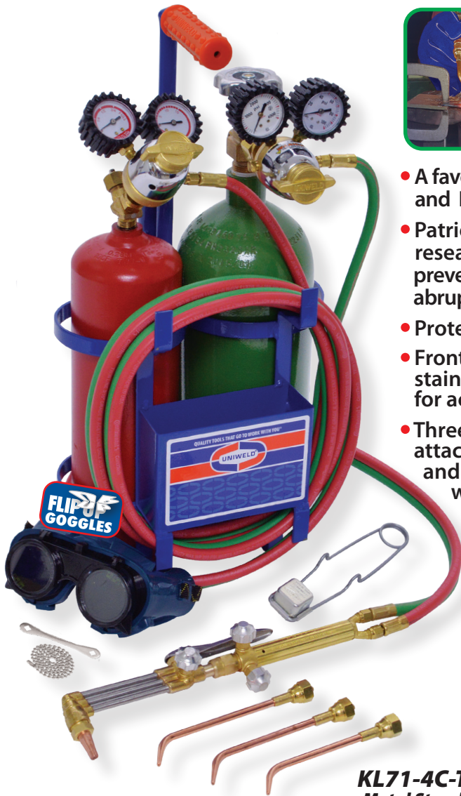
KL71-4C-T Metal Stand