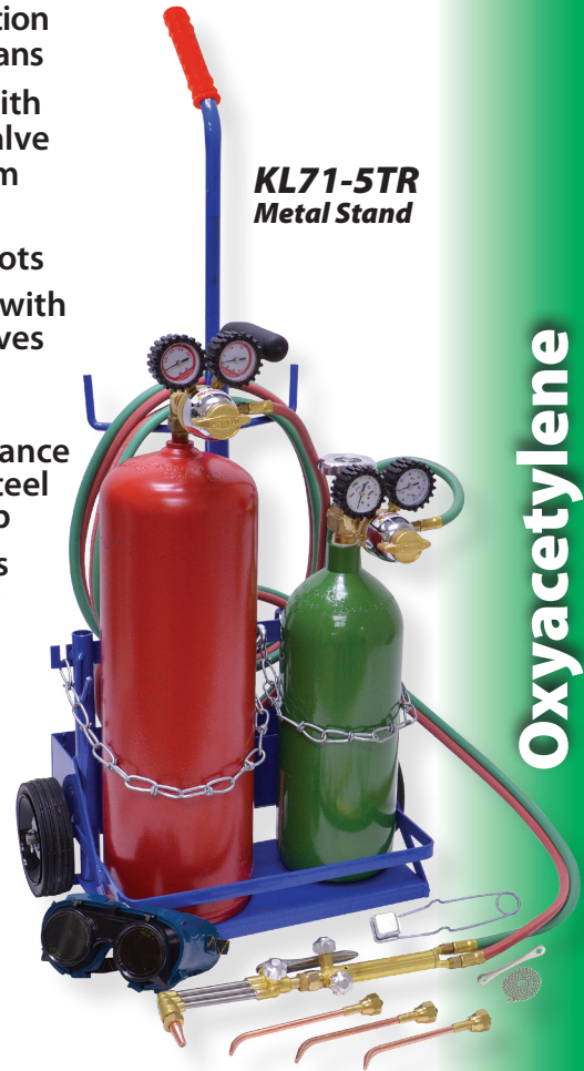
KL71-5TR Metal Stand