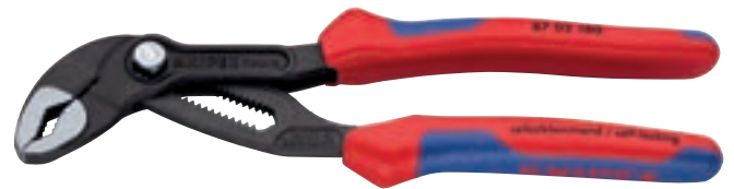
87 02 180 T