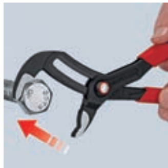
Position jaw – simply slide and close pliers