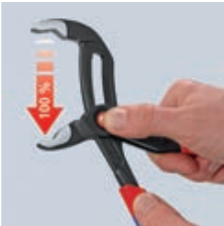
Press the button – open pliers completely

The KNIPEX Cobra® QuickSet combines all proven properties of the KNIPEX Cobra® with an additional push on function which makes it easier to work in very confined and inaccessible areas. Adjustment directly on the workpiece is possible by simply sliding the pliers handle. The hinge bolt locks itself with the first workload. The gripping width of the pliers is then fixed and can only be adjusted by pressing the button. The hinge bolt must be released by pressing the button and the pliers must be completely opened once to activate the QuickSet function again.