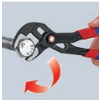
Hinge bolt locks itself with the first workload