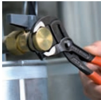
Fast and firm adjustment directly on the workpiece