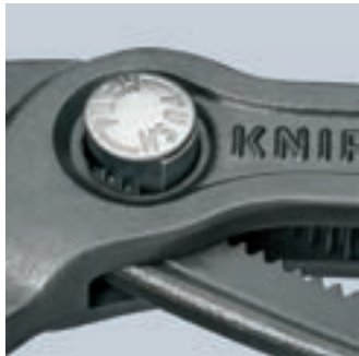
Fine adjustment by pushing a button: fast and comfortable