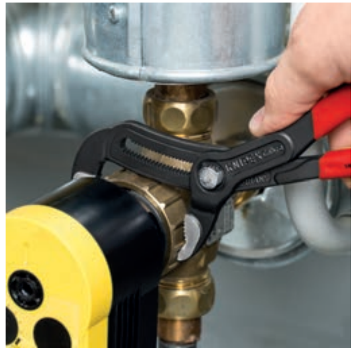
Teeth set against the direction of rotation have a self-locking effect and prevent slipping on the workpiece.