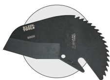
REPLACEMENT BLADE FOR 50034 50035