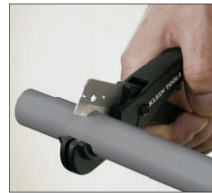
GUIDE HELPS CUT PIPE SQUARELY