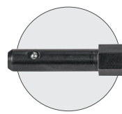
REPLACEMENT RETAINING PIN 50033