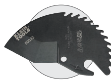
REPLACEMENT BLADE FOR 50031 50032