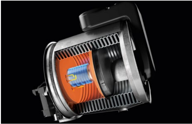
Low-emission, Viessmann-made MatriX Plus cylinder burner

The proprietary Viessmann modulating Lambda Pro Plus combustion control offers clean combustion, 10:1 turn down ratio and quiet operation with either propane or natural gas, which can be changed at the push of a button.