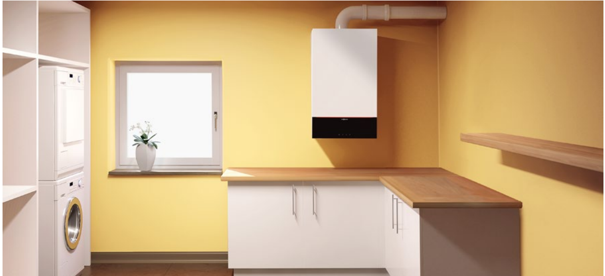
The Vitodens 100-W offers a reliable, compact solution for heating and on-demand domestic hot water (B1KE)

Equipped with a Viessmann stainless steel heat exchanger for lasting performance and reliability, plus a fully modulating Matrix Plus cylinder gas burner, the Vitodens 100-W wall-mounted condensing boiler is the perfect combination of value, quality and Viessmann technology.