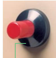
Manual Spark Igniter