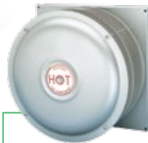
Vent Cap Assembly