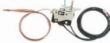
Optional Built-In Bulb Stat Kit (BBSK)

This heater may be installed in an aftermarket permanently located, manufactured home, where not prohibited by local codes.