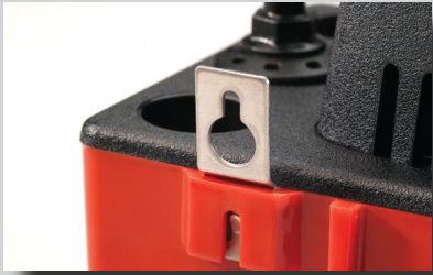
Metal Hang Tabs

Shatterproof stainless steel hang tabs have hole-and-slot design for easy mounting. Tabs are located on convenient 8" centers.