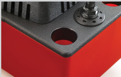
Four Inlet Holes

An elastomeric motor mounting gasket dampens vibration.