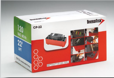
Full Color Packaging

Includes two 1/4" quick connect terminals to the built-in overflow switch allowing installer flexibility to connect air-handler shut-down. Switch features SPDT isolated contacts ready for connection to building automation systems. Also includes 60" lead kit to connect the overflow safety switch.