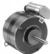
FIG. H D1050