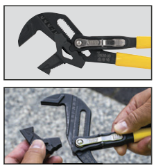
REPLACEMENT JAW 53010J