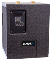
DHW Module 550003792D

The DHW Module is a great way to make domestic hot water when paired with our EXB boiler. ■ Digital control has the ability to set a consistent DHW temperature from 108°F - 140°F ■ Simple and flexible installation ■ Easy to service and clean