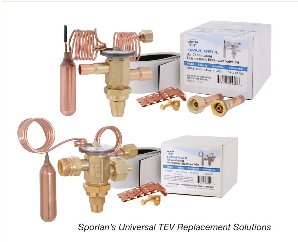
Sporlan's Universal TEV Replacement Solutions

Each valve comes with a 30" long capillary tube equalizer with flare nut. The single pushrod balanced port design ensures precise pin/port alignment, maintaining superior superheat control at wide load conditions.