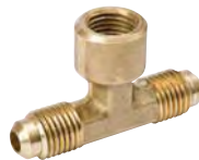
Tee • Three-Way Internal Branch Flare to Flare to Flare