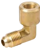
90° Elbow External Flare to NPTFI