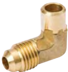
90° Elbow • Half Union Flare to Solder