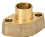
Flange • 2 Bolt-Hole w/ Serated Gasket Surface