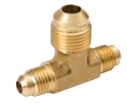
Tee • Three-Way Reducing Flare to Flare to NPTFE