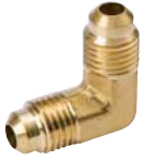
90° Elbow • Union Flare to Flare