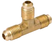
Tee • Three-Way Flare to Flare to Flare