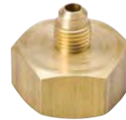
Refrigerant Drum Adapter