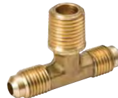
Tee • Two-Way Flare to Flare to NPTFE