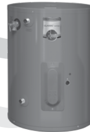
6, 10, 15, 19.9 and 30-Gallon