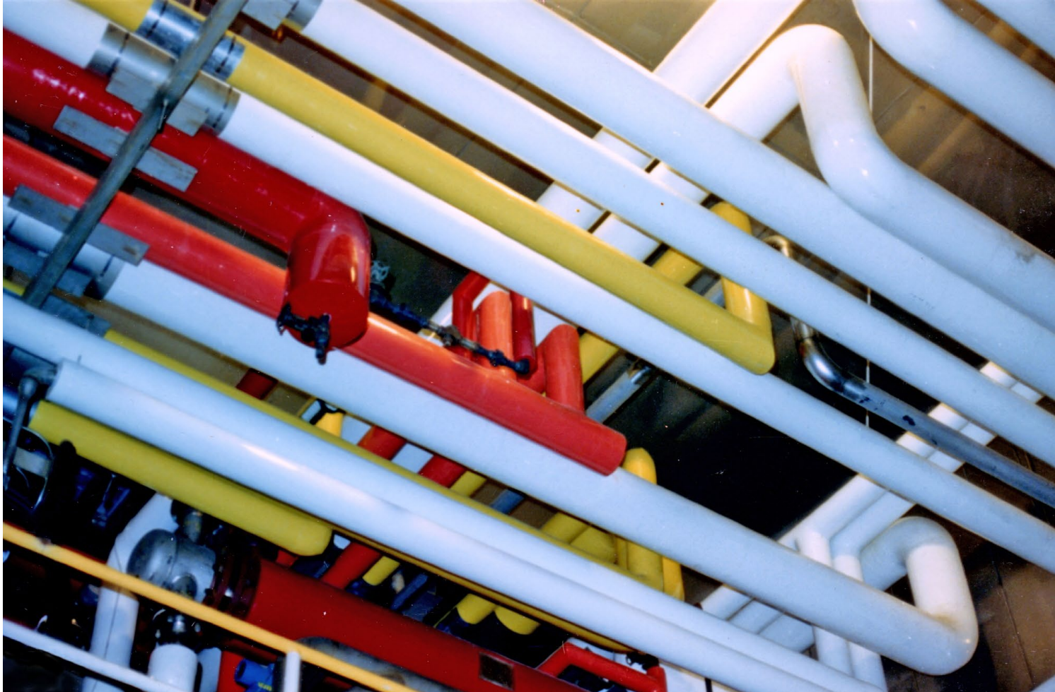
Aerocel® with SaniGuard™ available in white only