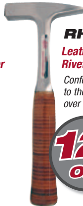
RH4 Leather Grippped Riveting Hammer Conforms perfectly to the user's hand over time.