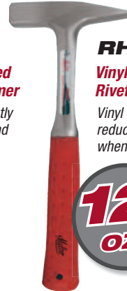
RH4V Vinyl Grippped Riveting Hammer Vinyl Grip helps reduce recoil when struck.