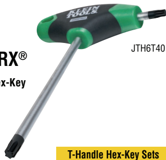
T-Handle Hex-Key Sets with Metal Stand