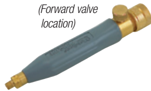
PLF-A5 Proline® (0386-0872)