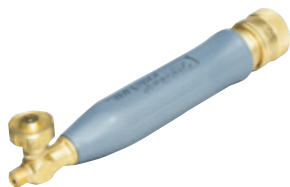
G4 TurboTorch® (0386-0308)