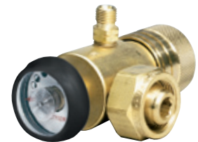
AR-B (0386-0725) AR-MC (0386-0726) AG-1 (0386-1200) (gauge only)