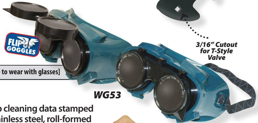
3/16" Cutout for T-Style Valve

Welding Goggles featuring flip-up #5 tinted lenses and molded-in air vents.