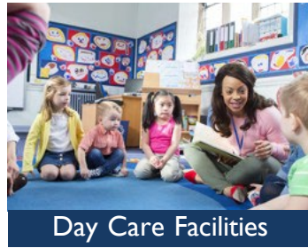
Day Care Facilities