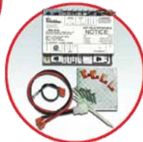
780-910 Universal Hot Surface Ignition Control