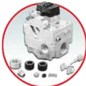
720-079 Universal Electronic Ignition Gas Valve