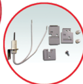
41-802N Universal Ignitor