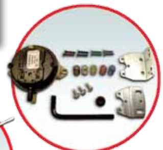
2374-510 Universal Air Pressure Sensing Switch