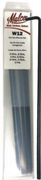
W12 7 Piece Set Big 12 in. Length

Available in 6 and 12 in. long series. Tough alloy steel with black oxide finish in clear storage tube.